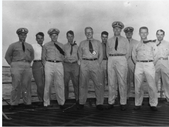
Walter Munk, fourth from the left

The combined resources of our University have proven a formidable resource in times of national needs. I welcome this opportunity to participate in the effort towards protecting our planet, before we are faced with a climatological Pearl Harbor.